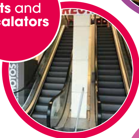
Lifts and escalators