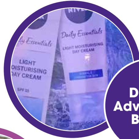
Digital Advertising Board